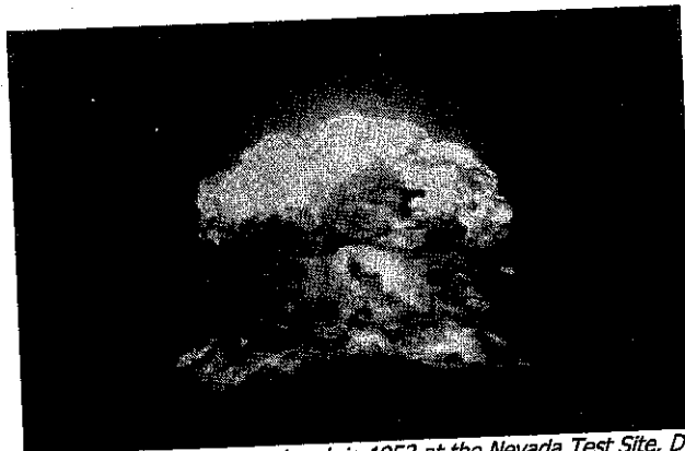
Explosion of U.S. nuclear bomb in 1953 at the Nevada Test Site.

Nuclear power also increases the risks the nuclear weapons proliferation. As more reactors are built around the world, nuclear material becomes more vulnerable to theft and diversion. Power reactors have also historically led directly to nuclear weapons programs in many countries.