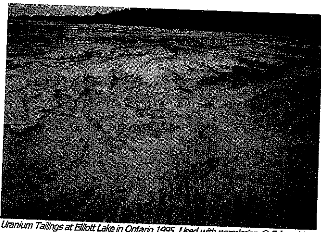
Uranium Tailings at Elliott Lake in Ontario 1995, Used with permission © Edward Burtynsky

Nuclear power is not a clean energy source. In fact, it produces both low and high-level radioactive waste that remains dangerous for several hundred thousand years. Generated throughout all parts of the fuel cycle, this waste poses a serious danger to human health. Currently, over 2,000 metric tons of high-level radioactive waste and 12 million cubic feet of low level radioactive waste are produced annually by the 103 operating reactors in the United States. 4 No country in the world has found a solution for this waste. Building new nuclear plants would mean the production of much more of this dangerous waste with no where for it to go.